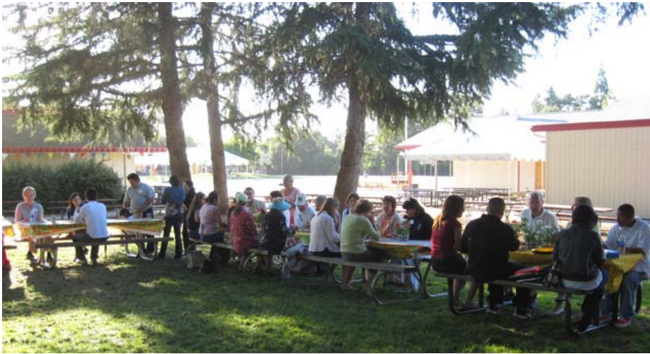
Summer Picnic in the Santa Rita School Redwood Grove